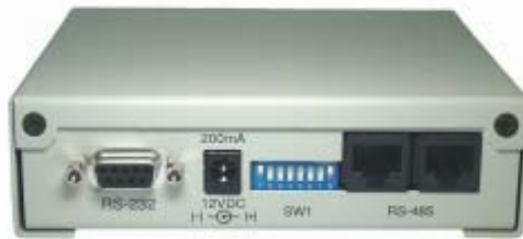
Figure 2: Regcom Rear Panel

The Hydra uses a bi-directional 2-wire RS-485 data bus to communicate to the slave devices. The device at each end of the network must be terminated. An 8-DIP switch on the rear of the unit is used to set the termination. Switch No. 8 is the terminal switch. When set to ON, the device is terminated. When set to OFF, it will be un-terminated.